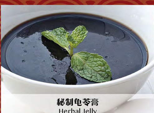
秘制龟苓膏 Herbal Jelly