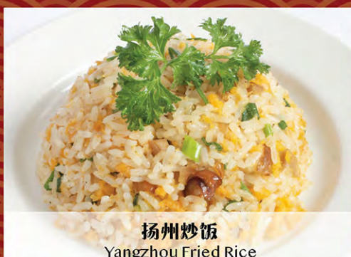
扬州炒饭 Yangzhou Fried Rice