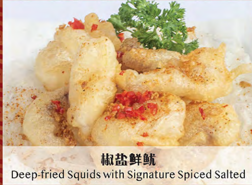
椒盐鲜鱿 Deep-fried Squids with Signature Spiced Salted