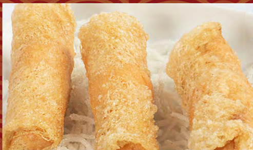
网纹泰式乌达卷 'Thai Style' Otak Rolls (3pcs)