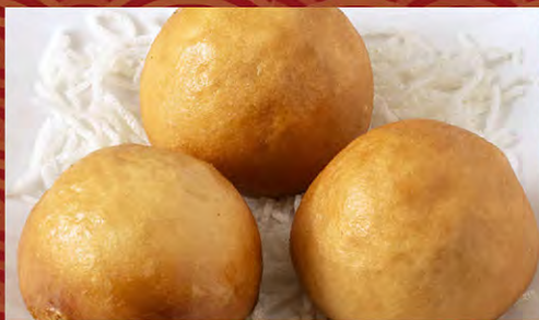
炸咸蛋莲蓉包 (3pcs) Deep-fried Salted Egg Yolk Buns with Lotus Paste