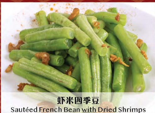
虾米四季豆 Sautéed French Bean with Dried Shrimps