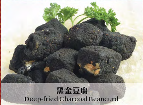
黑金豆腐 Deep-fried Charcoal Beancurd