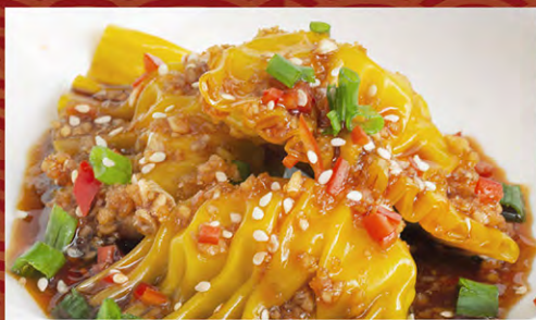
麻辣田园白菜饺子 Rural Cabbage Dumplings in Spicy Sauce (3pcs)