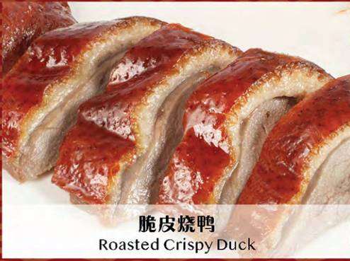
脆皮烧鸭 Roasted Crispy Duck