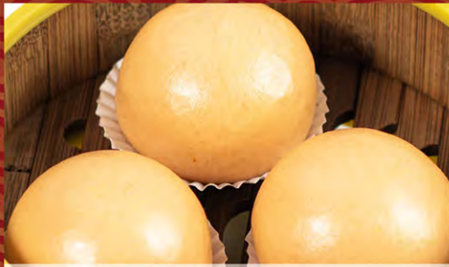
咸蛋奶黄流砂包 Custard Buns with Salted Egg Yolk (3pcs)