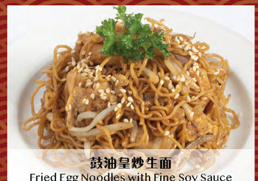
鼓油皇炒生面 Fried Egg Noodles with Fine Soy Sauce