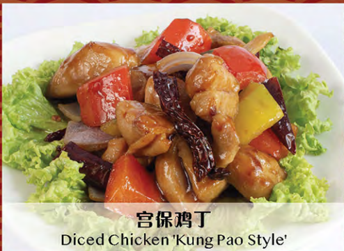
宫保鸡丁 Diced Chicken 'Kung Pao Style'