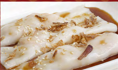
鲜虾 / 鸡叉烧滑肠粉 Cheong Fun with Prawns / Chicken 'Char Siew'