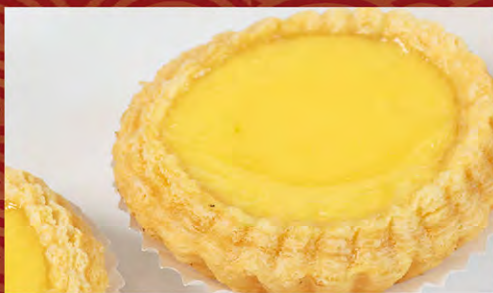
蛋挞 Baked Egg Tart (3pcs)