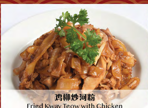
鸡柳炒河粉 Fried Kway Teow with Chicken