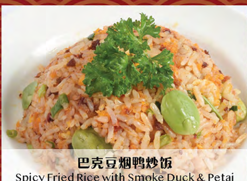
巴克豆烟鸭炒饭 Spicy Fried Rice with Smoke Duck & Petai