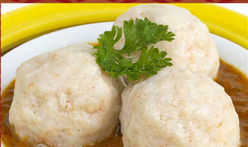
娘惹蒸明虾丸 Prawn Balls served in Nyonya Sauce (3pcs)