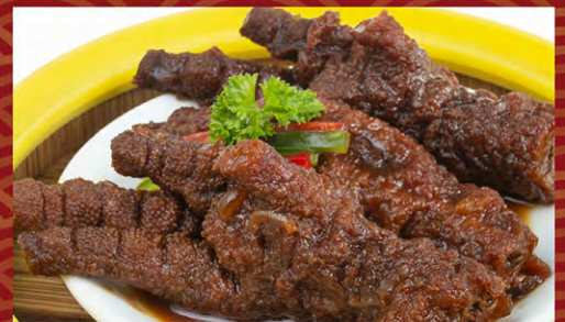
好味酱蒸凤爪 Chicken Feet in Spicy Sauce