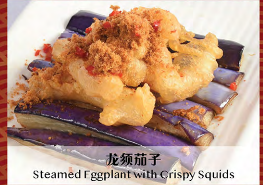
龙须茄子 Steamed Eggplant with Crispy Squids