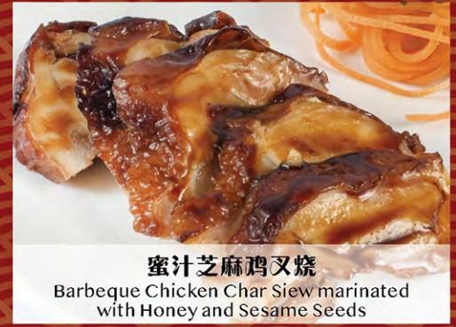
蜜汁芝麻鸡叉烧 Barbeque Chicken Char Siew marinated with Honey and Sesame Seeds