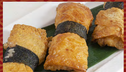
紫菜五香腐皮卷 Beancurd Skin Rolls (3pcs)