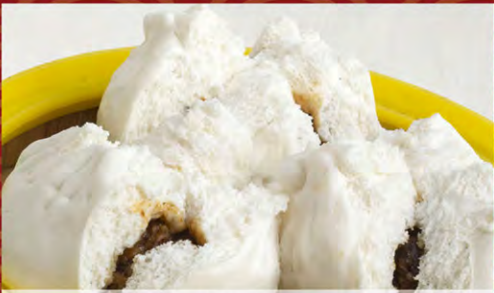
蜜汁叉烧包 BBQ Chicken Buns (3pcs)