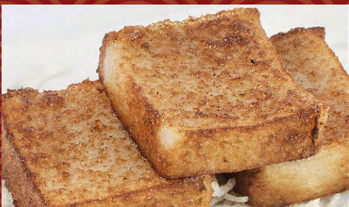
煎脆皮萝卜糕 Pan-fried Radish Cakes (3pcs)