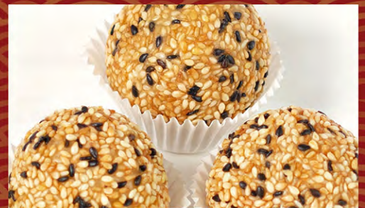
花生芝麻枣 Deep-fried Sesame Balls with Peanut Paste (3pcs)