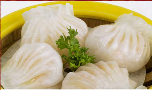
水晶虾饺王 Crystal Prawn Dumplings (4pcs)