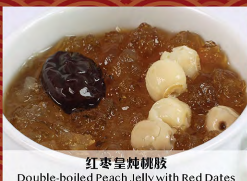
红枣皇炖桃胶 Double-boiled Peach Jelly with Red Dates