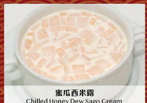
蜜瓜西米露 Chilled Honey Dew Sago Cream