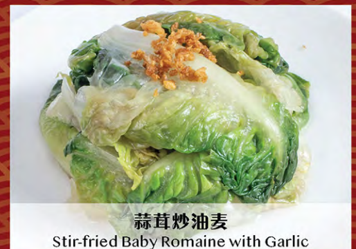
蒜茸炒油麦 Stir-fried Baby Romaine with Garlic