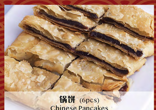
锅饼 (6pcs) Chinese Pancakes

Any food wastage will be charged according to normal price in ala carte menu