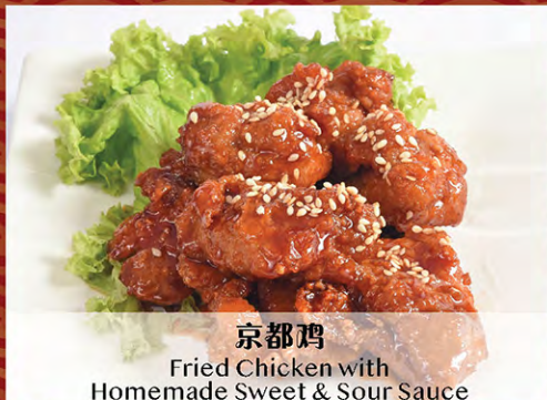
京都鸡 Fried Chicken with Homemade Sweet & Sour Sauce