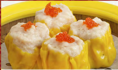
鱼籽花菇滑烧卖 'Siew Mai' with Flower Mushroom (4pcs)