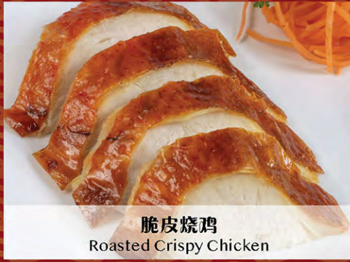
脆皮烧鸡 Roasted Crispy Chicken