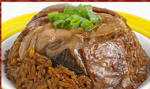
招牌糯米鸡 Glutinous Rice with Chicken & Mushroom