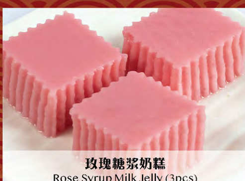
玫瑰糖浆奶糕 Rose Syrup Milk Jelly (3pcs)