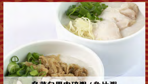
冬菜白果肉碎粥 / 鱼片粥 Congee with Minced Meat, Gingko and Preserved Vegetable / Congee with Fish

Any food wastage will be charged according to normal price in ala carte menu