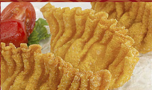
沙律炸明虾角 Crispy Salad Prawn Dumplings (3pcs)