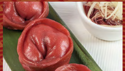
甜菜根煎饺子 Pan-fried Beetroot Dumplings (3pcs)