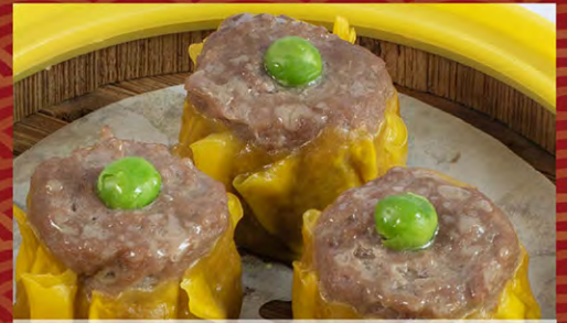
牛肉烧卖 Beef 'Siew Mai' (3pcs)