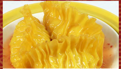
泰式素翅卖 'Thai Style' Vegetarian Shark' Fin Dumplings (3pcs)