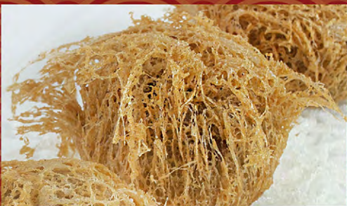
蜂巢芋角 Yam Dumplings (3pcs)