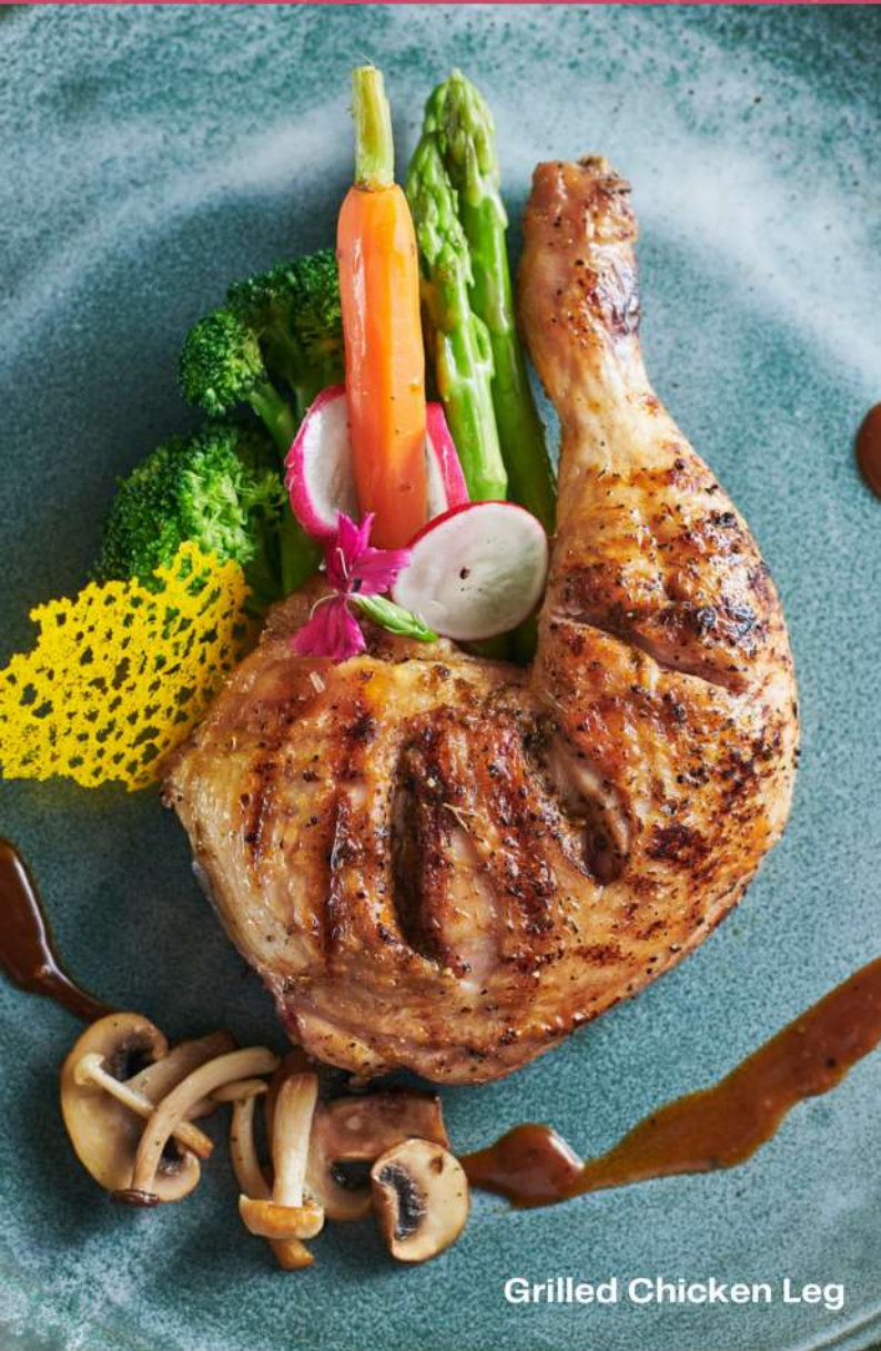
Grilled Chicken Leg