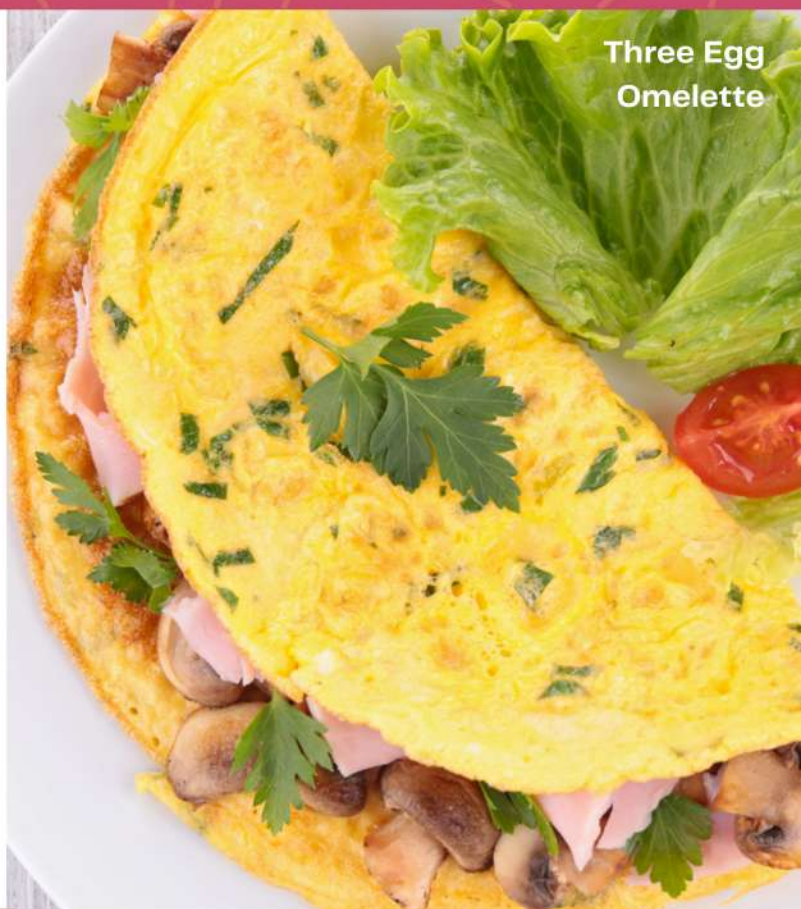
Three Egg Omelette