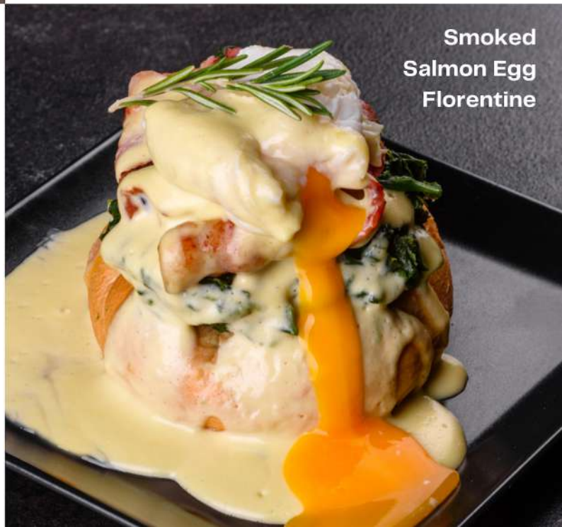
Smoked Salmon Egg Florentine

RM10 - Tomato / Sauteed Mushrooms / Hash Brown Potato / Baked Beans / Beef Strips / Chicken or Beef Sausage.