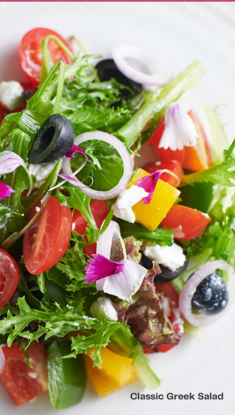
Classic Greek Salad