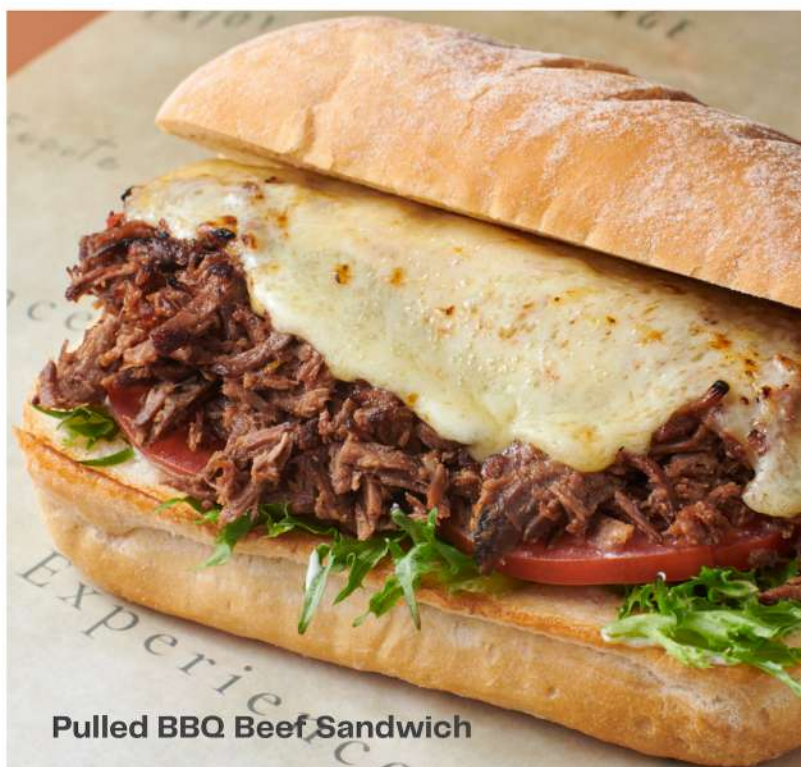
Pulled BBQ Beef Sandwich