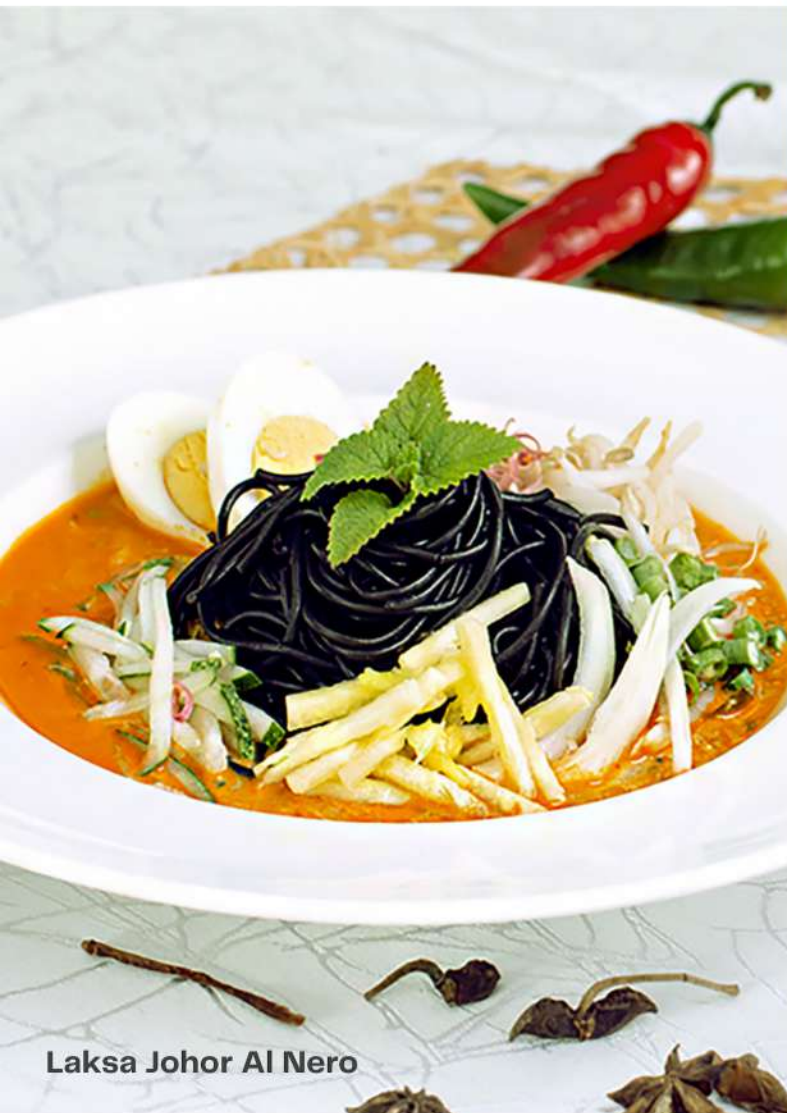
Laksa Johor Al Nero