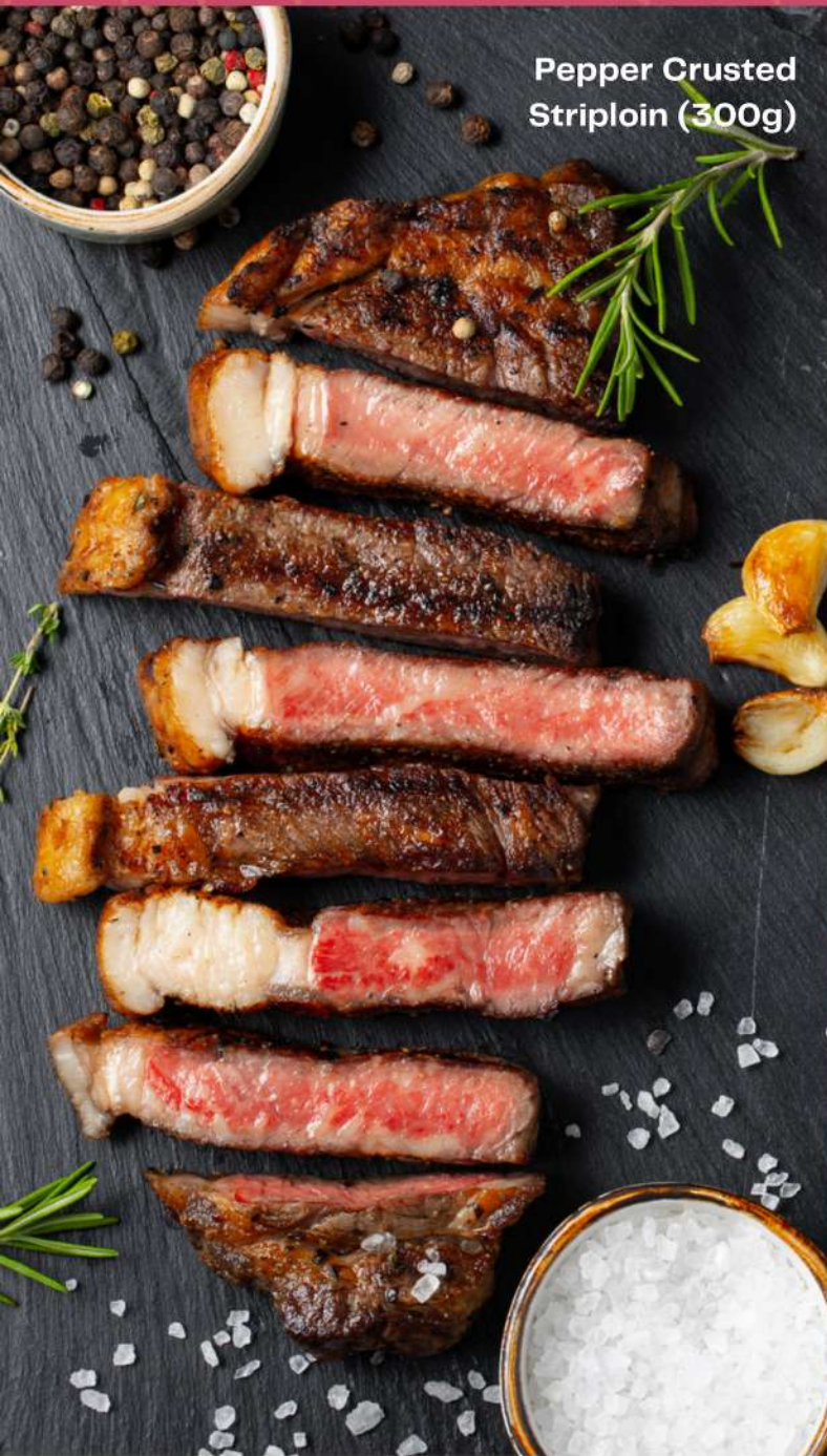
Pepper Crusted Striploin (300g)