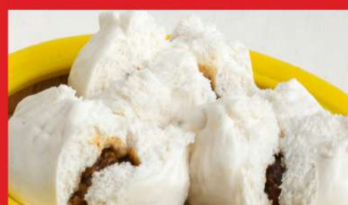
蜜汁叉烧包 BBQ Chicken Buns (3pcs)