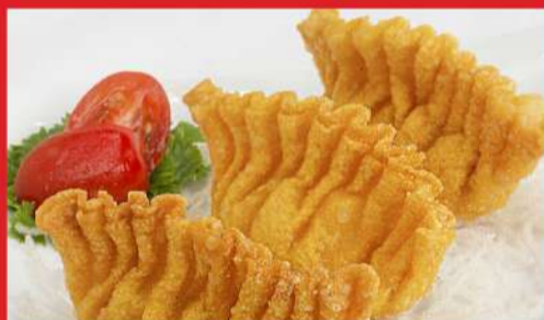
沙律炸明虾角 Crispy Salad Prawns Dumplings (3pcs)