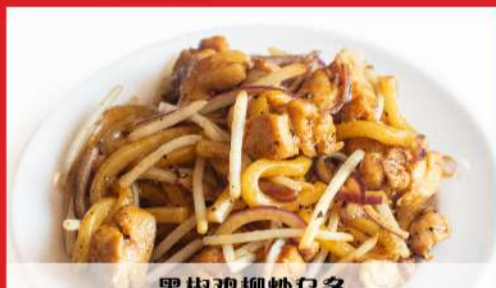
黑椒鸡柳炒乌冬 Fried Udon with Chicken and Black Pepper Sauce