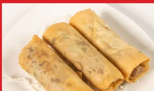
顺风顺水炸春卷 Crispy Spring Rolls with Shredded Yam (3pcs)