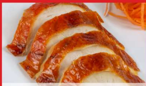
脆皮烧鸡 Roasted Crispy Chicken