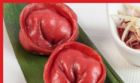
甜菜根煎饺子 Pan-fried Beetroot Dumplings (3pcs)