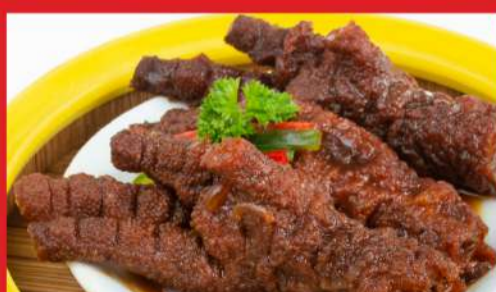
好味酱蒸凤爪 Chicken Feet