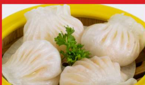
水晶虾饺王 Crystal Prawn Dumplings (4pcs)