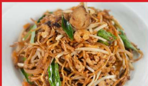
金香炒生面 Fried Egg Noodles with 'Kam Heong' Sauce