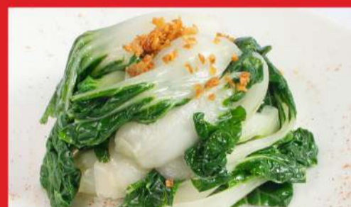
蒜茸炒奶白 Stir-fried Nai Pak with Garlic