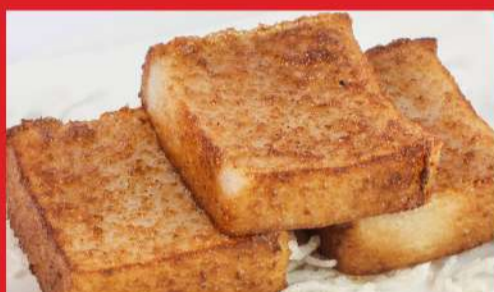
脆皮萝卜糕 Pan-fried Radish Cakes (3pcs)