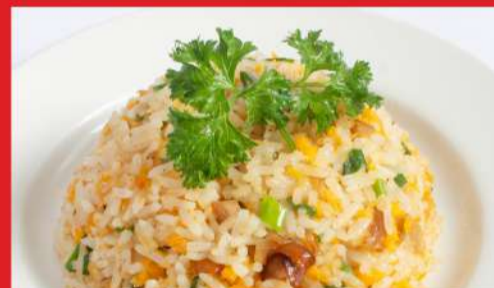
扬州炒饭 Yang Chow Fried Rice