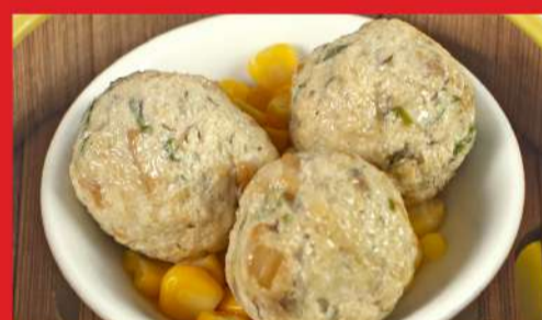
金银满屋蒸鱼蛋 Special Homemade Fish Balls (3pcs)