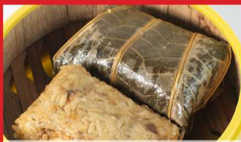
黄金荷叶腊味饭 Glutinous Rice with Waxed Meat wrapped in Lotus Leaf(2pcs)