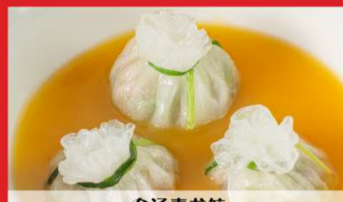
金汤青龙饺 Dragon Chives Dumplings with Pumpkin Sauce (3pcs)