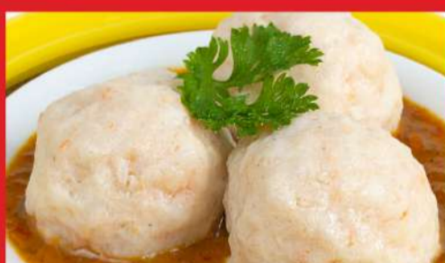
酿惹蒸明虾丸 Prawns Ball in Nyoya Sauce (3pcs)