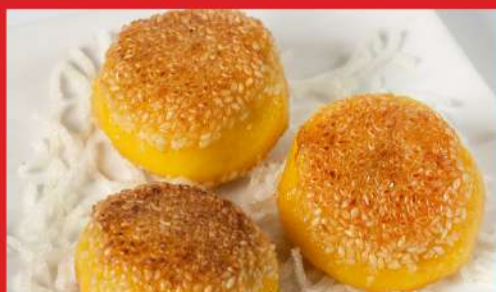
龙凤呈祥韭菜糰 Pan-fried Chives Dumplings (3pcs)