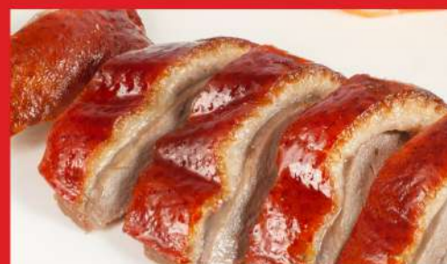
脆皮烧鸭 Roasted Crispy Duck