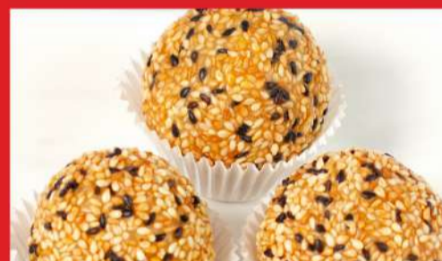
花生芝麻枣 Sesame Ball with Peanut Paste (3pcs)