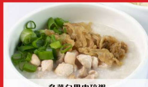
冬菜白果肉碎粥 Congee with Minced Meat, Gingko and Preserved Vegetable