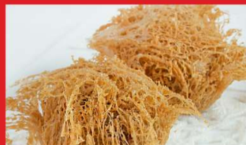
蜂巢芋角 Yam Dumplings (3pcs)