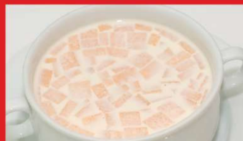
蜜瓜西米露 Chilled Honey Dew Sago Cream