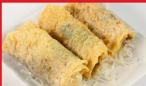
凤凰肉松豆腐卷 Chicken Floss and Beancurd Rolls (3pcs)