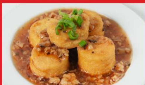
红烧肉碎豆腐 Braised Beancurd with Minced Chicken