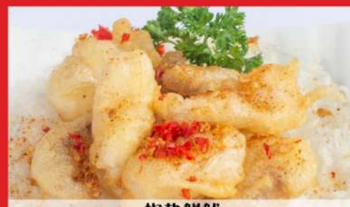
椒盐鲜鱿 Deep-fried Squid with Signature Spiced Salted