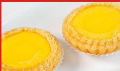
蛋挞 Baked Egg Tarts (3pcs)