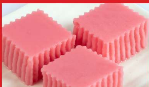
玫瑰糖浆奶糕 Rose Syrup Milk Jelly (3pcs)