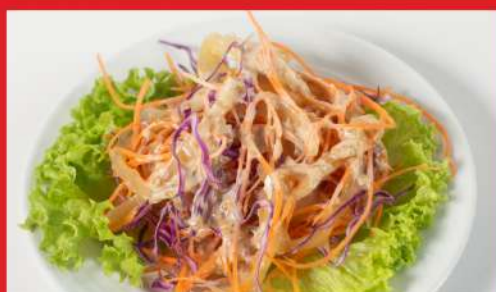
胡麻沙律海蜇 Chilled Jelly Fish with Sesame Oil