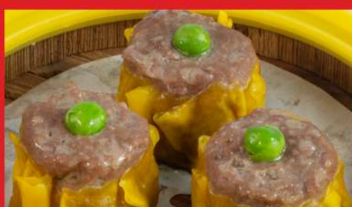
牛肉烧卖 Beef Siew Mai' (3pcs)