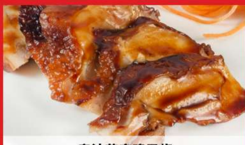
蜜汁芝麻鸡叉烧 Barbeque Chicken Char Siew marinated with Honey and Sesame Seeds