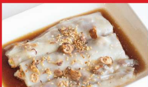
鸡叉烧滑肠粉 Chicken 'Char Siew' (3pcs)