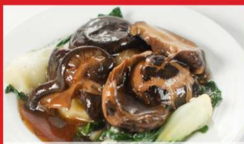
发财冬菇时蔬 Braised Mushroom and Seasonal Green with Fatt Choy