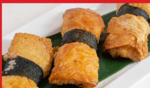
紫菜五香腐皮卷 Beancurd Skin Rolls (3pcs)