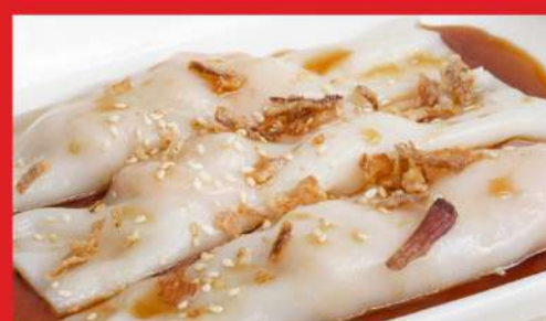
鲜虾滑肠粉 Cheong Fun with Prawns (3pcs)

Any food wastage will be charged according to normal price in ala carte menu