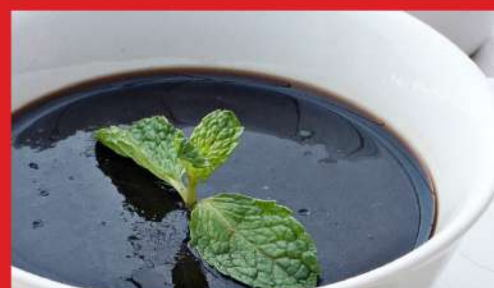
秘制龟苓膏 Herbal Jelly