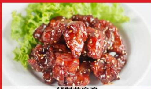
秘制芝麻鸡 Fried Chicken with Chef Special Sauce and Sesame