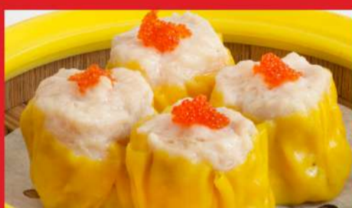
鱼子花菇滑烧卖 Siew Mai' with Flower Mushroom (4pcs)