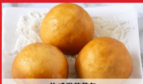
炸咸蛋莲蓉包 Deep-fried Crispy Salted Egg Yolk and Lotus Paste Bun (3pcs)