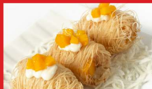
金线香芒卷 Crispy Vermicelli Mango Rolls (3pcs)