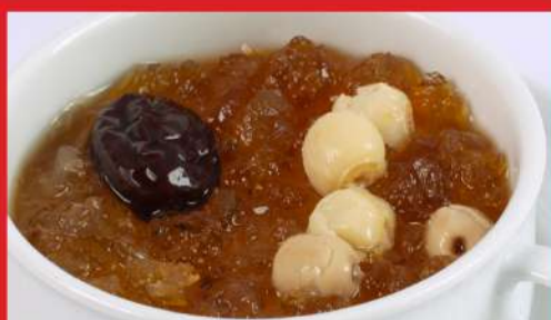
红枣皇炖桃胶 Double-boiled Peach Jelly with Red Dates