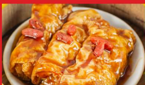
聚宝鲍汁鲜竹卷 (3pcs) Beancurd Skin Rolls with Abalone Sauce