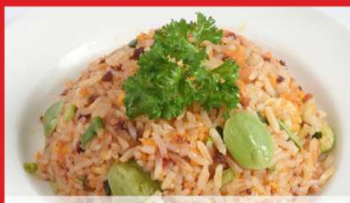
巴克豆烟鸭炒饭 Fried Rice with Smoke Duck, Petai and Spicy Sauce