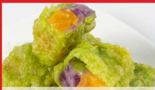
甜蜜芋蓉炸年糕 Deep-fried 'Nian Gao' with Teowchew Sweet Yam Paste (3pcs)