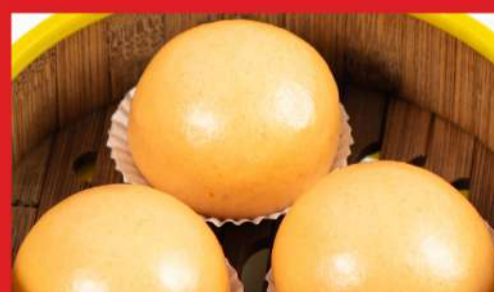
咸蛋奶黄流砂包 Custard Buns with Salted Egg Yolk (3pcs)