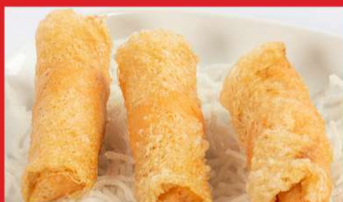
网纹泰式乌达卷 Otak Rolls in 'Thai' Style (3pcs)