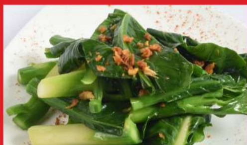
蒜茸炒芥兰 Stir-fried Kai Lan with Garlic