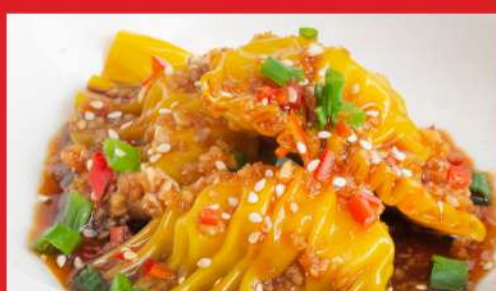
麻辣田园白菜饺子(3pcs) Rural Cabbage Dumplings in Spicy Sauce