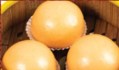
咸蛋奶黄流砂包 Custard Buns with Salted Egg Yolk (3pcs)