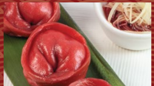
甜菜根煎饺子 Pan-fried Beetroot Dumplings (3pcs)