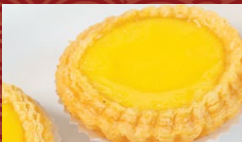
蛋挞 Baked Egg Tart (3pcs)