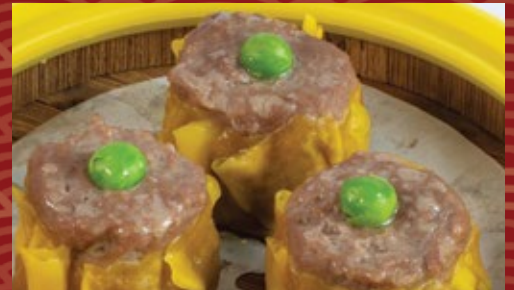
牛肉烧卖 Beef 'Siew Mai' (3pcs)