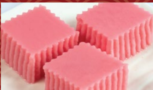
玫瑰糖浆奶糕 Rose Syrup Milk Jelly (3pcs)