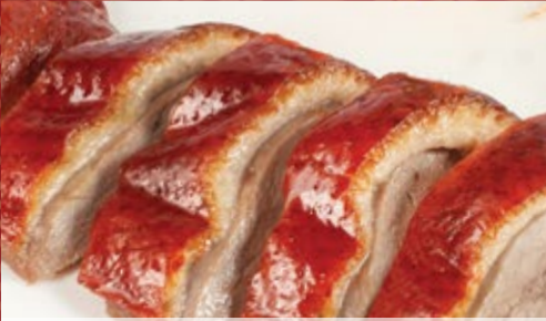
脆皮烧鸭 Roasted Crispy Duck