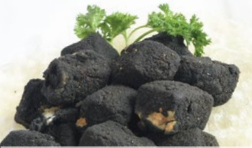
黑金豆腐 Deep-fried Charcoal Beancurd