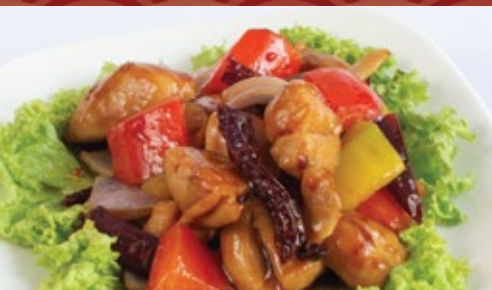
宫保鸡丁 Diced Chicken 'Kung Pao Style'