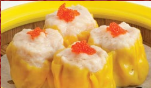
鱼籽花菇滑烧卖 'Siew Mai' with Flower Mushroom (4pcs)