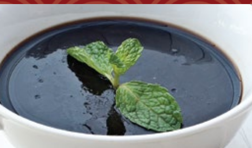
秘制龟苓膏 Herbal Jelly