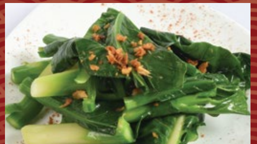
蒜茸炒芥兰 Stir-fried Kai Lan with Garlic