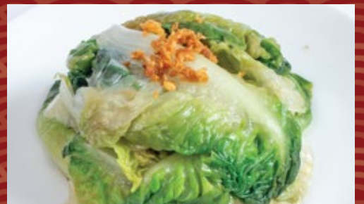
蒜茸炒油麦 Stir-fried Baby Romaine with Garlic