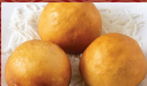
炸咸蛋莲蓉包 (3pcs) Deep-fried Salted Egg Yolk Buns with Lotus Paste