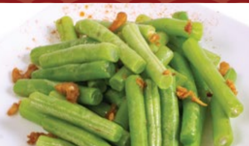
虾米四季豆 Sautéed French Bean with Dried Shrimps