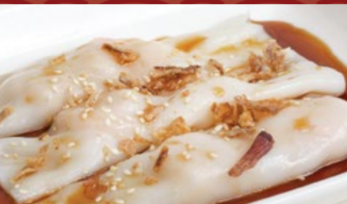
鲜虾 / 鸡叉烧滑肠粉 Cheong Fun with Prawns / Chicken 'Char Siew'