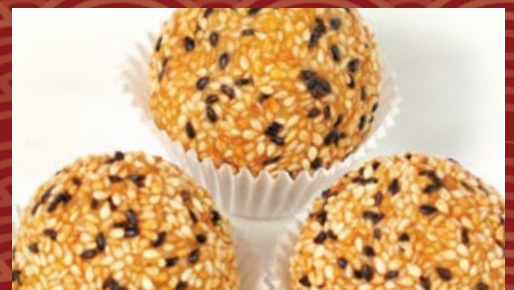
花生芝麻枣 Deep-fried Sesame Balls with Peanut Paste (3pcs)