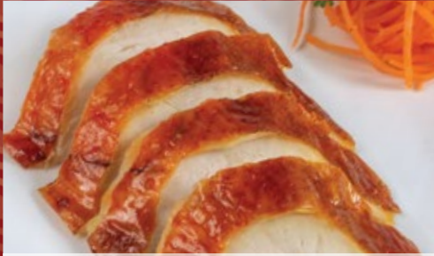
脆皮烧鸡 Roasted Crispy Chicken