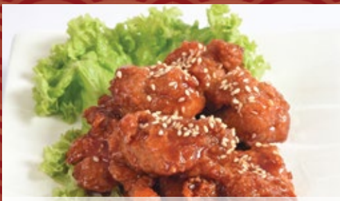
京都鸡 Fried Chicken with Homemade Sweet & Sour Sauce