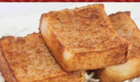
煎脆皮萝卜糕 Pan-fried Radish Cakes (3pcs)