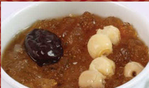
红枣皇炖桃胶 Double-boiled Peach Jelly with Red Dates