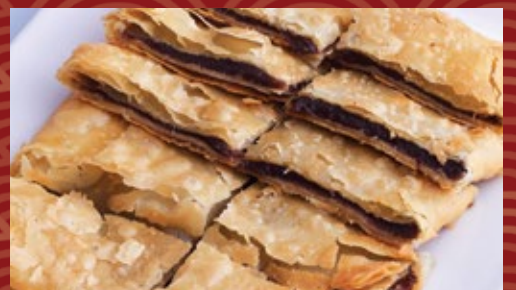
锅饼 (6pcs) Chinese Pancakes

Any food wastage will be charged according to normal price in ala carte menu