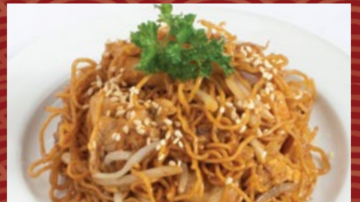
鼓油皇炒生面 Fried Egg Noodles with Fine Soy Sauce