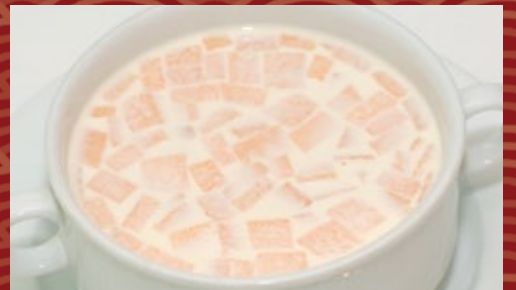
蜜瓜西米露 Chilled Honey Dew Sago Cream