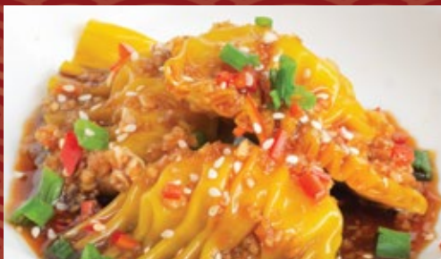
麻辣田园白菜饺子 Rural Cabbage Dumplings in Spicy Sauce (3pcs)