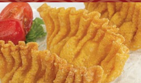
沙律炸明虾角 Crispy Salad Prawn Dumplings (3pcs)