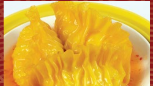
泰式素翅卖 'Thai Style' Vegetarian Shark' Fin Dumplings (3pcs)