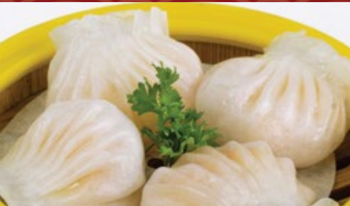
水晶虾饺王 Crystal Prawn Dumplings (4pcs)