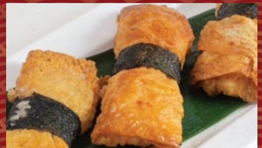
紫菜五香腐皮卷 Beancurd Skin Rolls (3pcs)