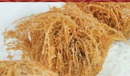
蜂巢芋角 Yam Dumplings (3pcs)