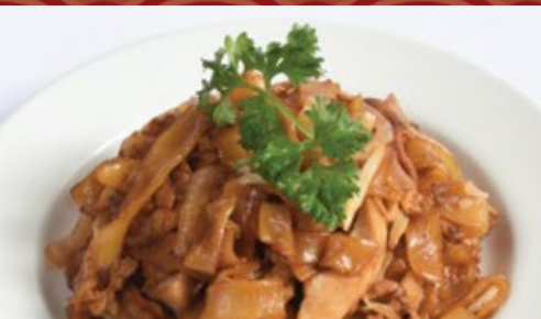
鸡柳炒河粉 Fried Kway Teow with Chicken