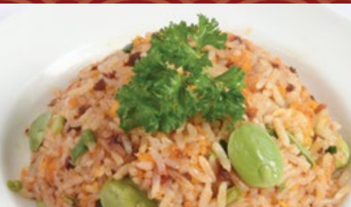
巴克豆烟鸭炒饭 Spicy Fried Rice with Smoke Duck & Petai