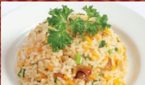
扬州炒饭 Yangzhou Fried Rice