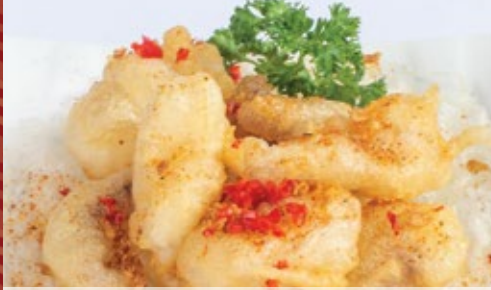
椒盐鲜鱿 Deep-fried Squids with Signature Spiced Salted