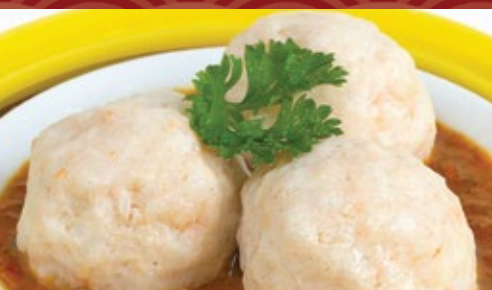
娘惹蒸明虾丸 Prawn Balls served in Nyoya Sauce (3pcs)