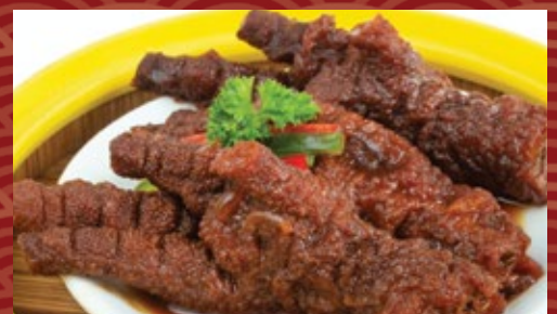
好味酱蒸凤爪 Chicken Feet in Spicy Sauce