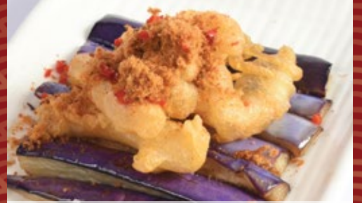
龙须茄子 Steamed Eggplant with Crispy Squids