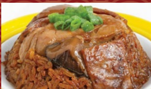
招牌糯米鸡 Glutinous Rice with Chicken & Mushroom