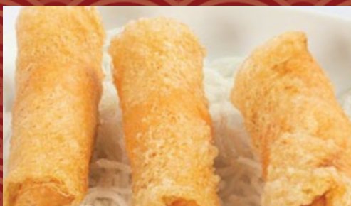
网纹泰式乌达卷 'Thai Style' Otak Rolls (3pcs)