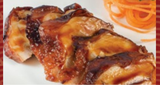
蜜汁芝麻鸡叉烧 Barbeque Chicken Char Siew marinated with Honey and Sesame Seeds