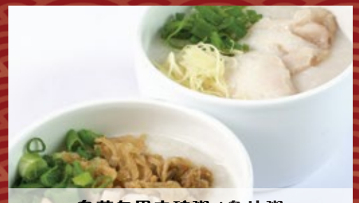
冬菜白果肉碎粥 / 鱼片粥 Congee with Minced Meat, Gingko and Preserved Vegetable / Congee with Fish

Any food wastage will be charged according to normal price in ala carte menu