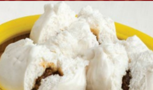
蜜汁叉烧包 BBQ Chicken Buns (3pcs)